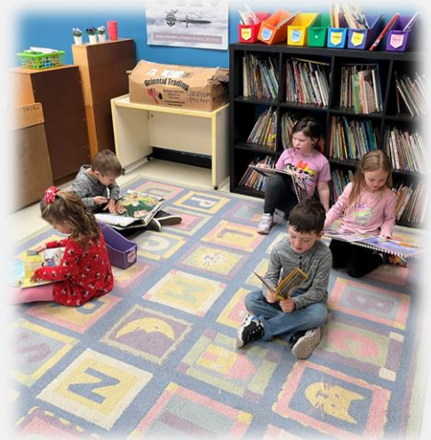
Kindergarten Reading Time