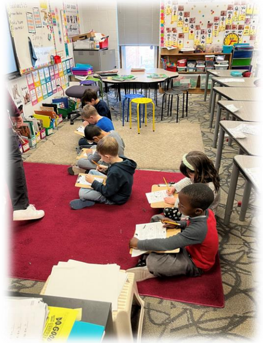
1 st Graders Hard at Work

January 24th- Second Grade Show and Tell and Flashlight Friday