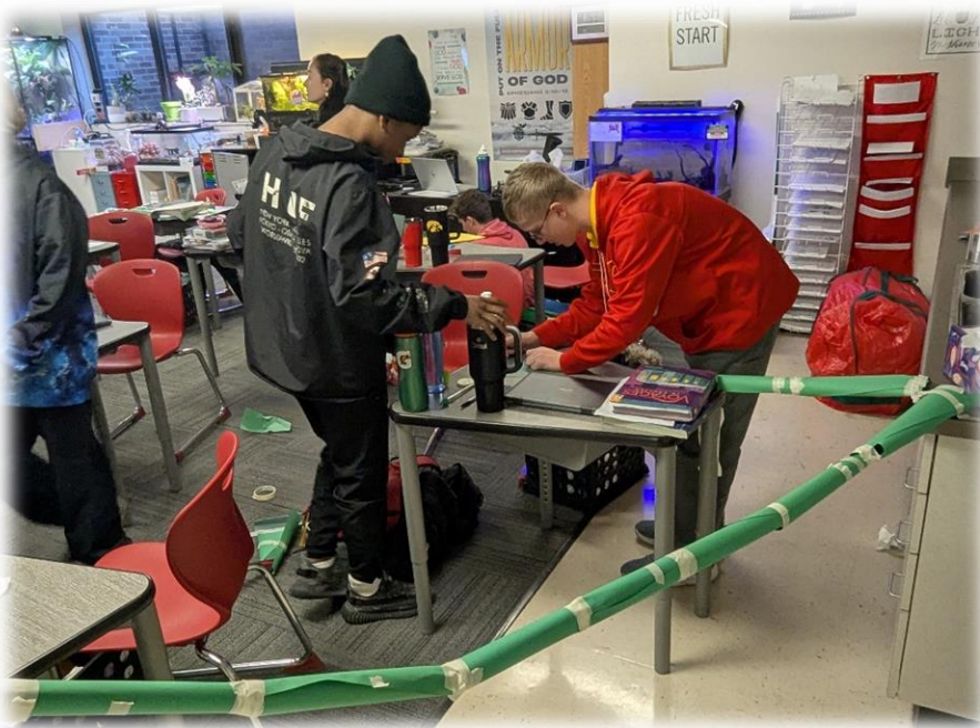
STEM Fun for Fancy Friday