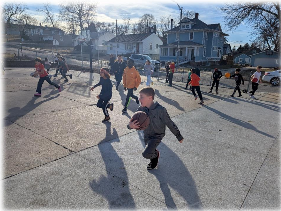
Enjoying 50-Degree Weather in January!