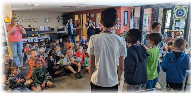
Gold medalists in the "Math Facts" competition