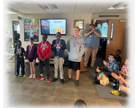
Bronze hula hoopers