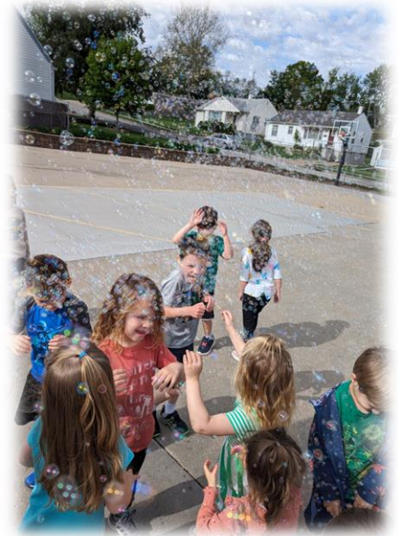
Fun with bubbles!