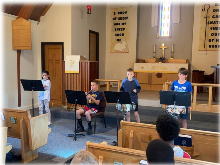
4th & 5th graders leading a band demonstration for their classmates

FED by the Word, FOLLOW Christ in his love, and FIND the lost with his Word.