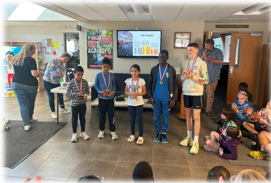
Hula Hooping gold medalists!

There will be no more memory work for the last two weeks of this school year.