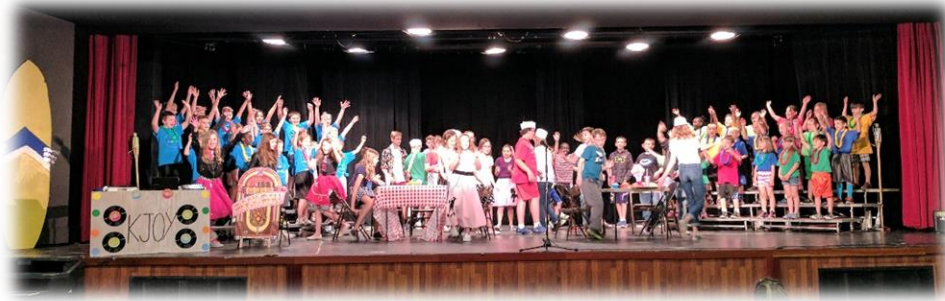
"Not Your Average Joe" (2017)

Snapshots from Play Nights in years past!