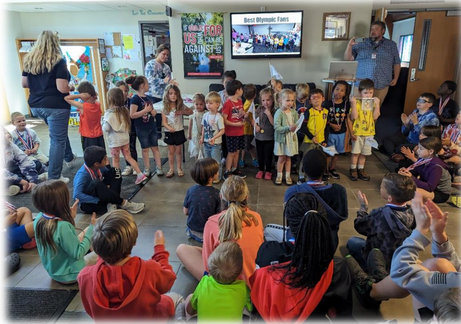
Preschool receiving their medals for being the best Olympics fans!