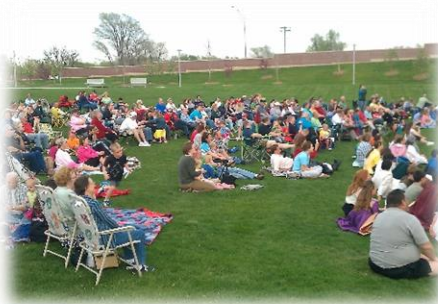
Practicing "A Dragon's Tale" at Stinson Park (L) & the audience getting settled in (R)