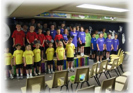
Disney Musical Revue (2007)