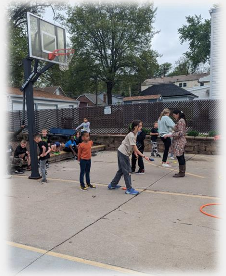
Bean bag toss competitors