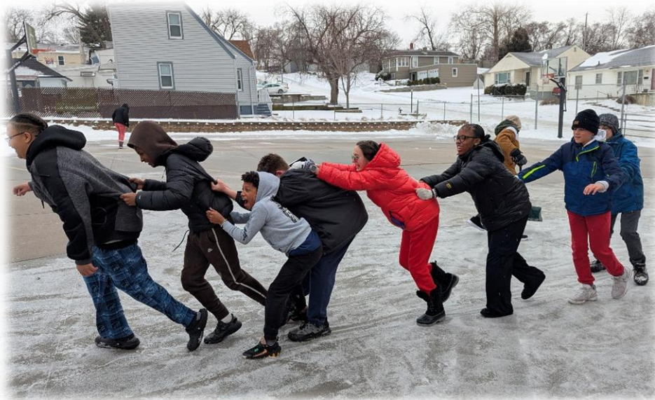
Making the most of the graupel that fell on Friday