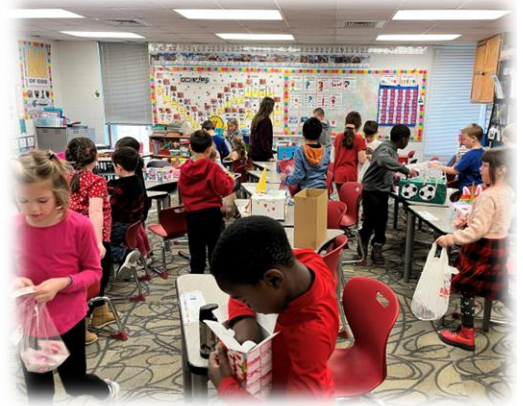
Handing out Valentine's in K-2

February 21st- Field Trip to the Rose Theater (K-5th) February 24th-27th- Christian Education Week February 28th-March 3rd- No School