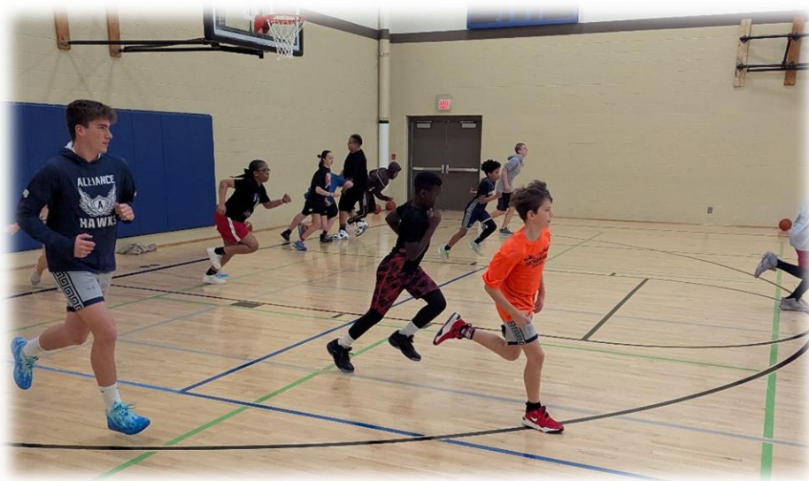
Conditioning drills at basketball practice