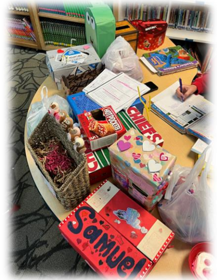
Valentine's Day Boxes